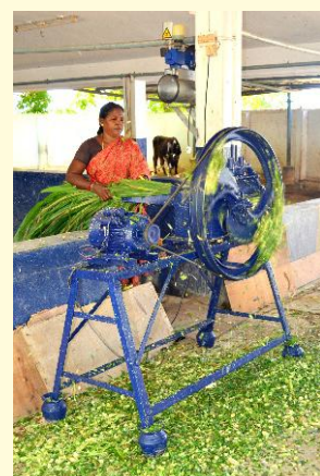
Grass Cutting Machine